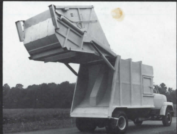
Telescopic ejection cylinder allows clean emptying by extending curved ejection blade beyond body.