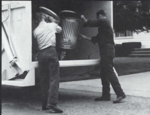
Low sill height, unobstructed 2 cu. yd. hopper, 10 second reload time and 20 second cycle time speeds collection.