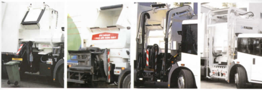
SIDELIFT C240 SIDELIFT C1100 SIDELIFT CM1100 SIDELIFT M1100

240 l by operation from the cab. In manual operation with a trunnion lifting device it can manage containers up to 1100 l. The same volume of container is lifted by the manually operated SIDELIFT M1100.