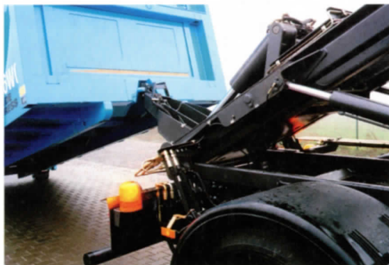
The hook arm of the HAWKCHANGE has the demountable containers under control. In one fluid movement, the containers can be lifted or replaced.

1 Without auxiliary frame (acc. DIN 70020). Subject to change without prior notice.