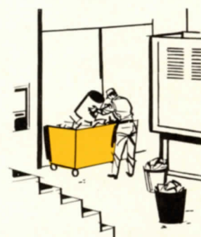
APARTMENTS & OFFICE BUILDINGS