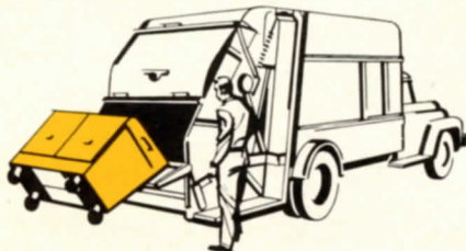
OPERATE CONTROL . . .