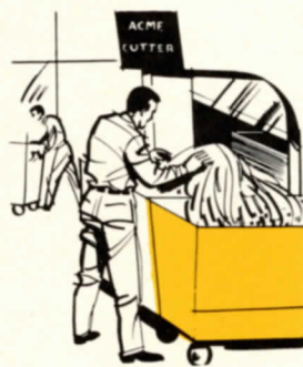
FACTORIES & AIRPORTS