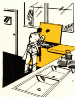
RESTAURANTS & SUPERMARKETS