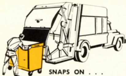
SNAPS ON . . .

HEIGHT: 45 inches WIDTH: 24½ inches LENGTH: 63 inches CAPACITY: 1 cubic yard