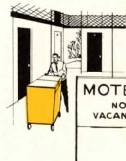
HOTELS & STORES