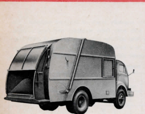
HEIL COLECTO-MATIC GARBAGE-REFUSE COLLECTION UNITS