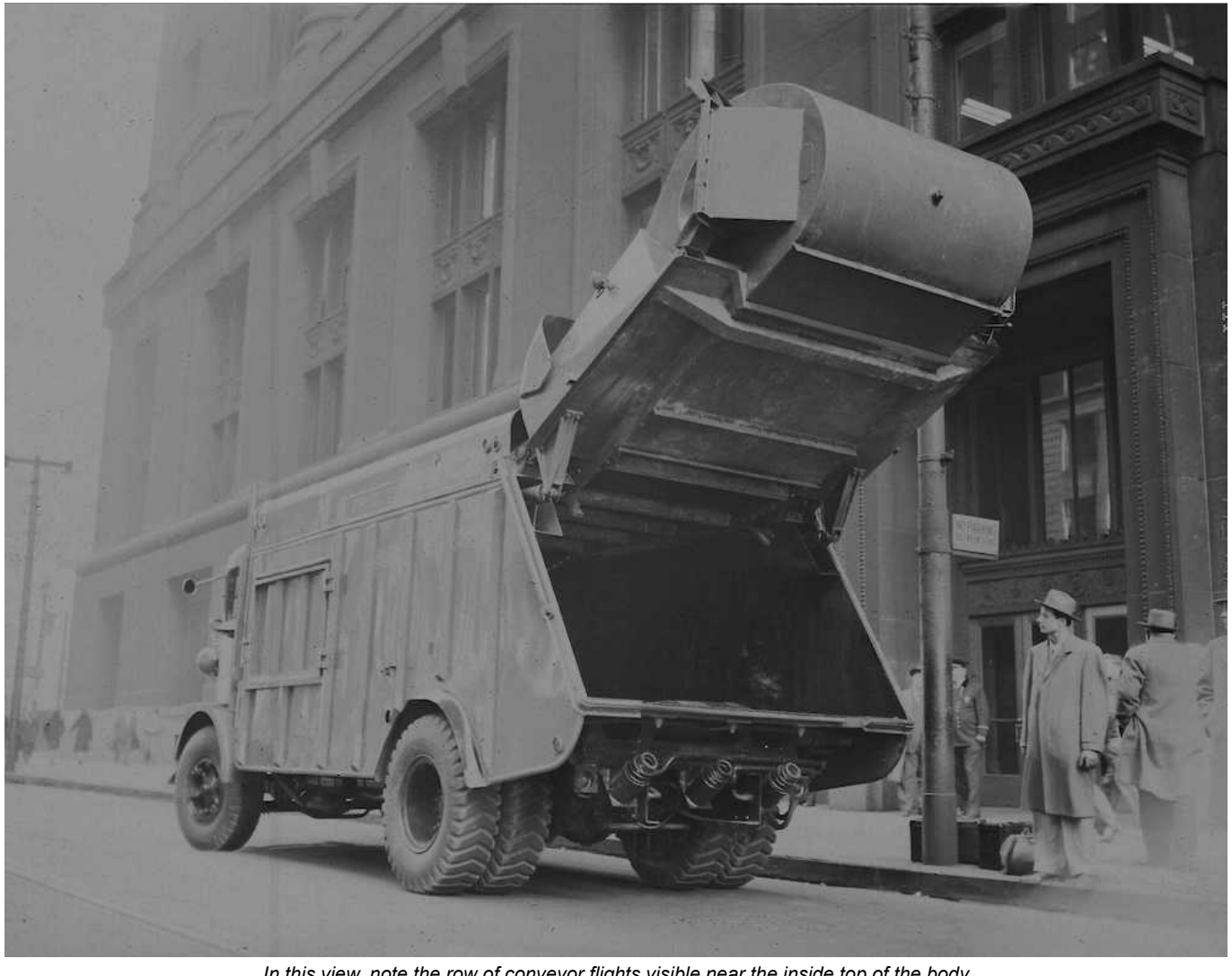
In this view, note the row of conveyor flights visible near the inside top of the body