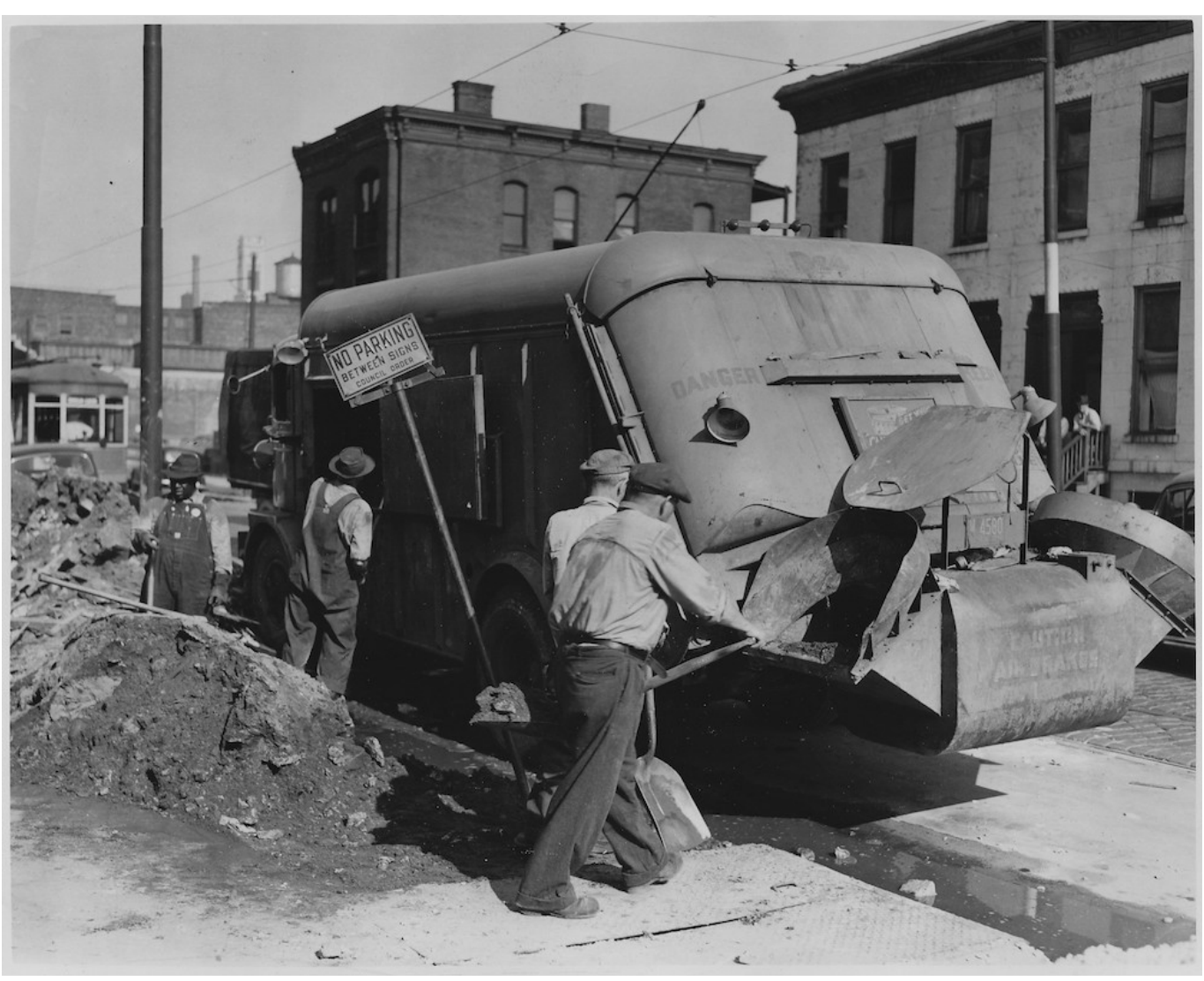
Crewmen loading demolition debris into a Heil Conveyor, which was capable of handling granular material as well has refuse