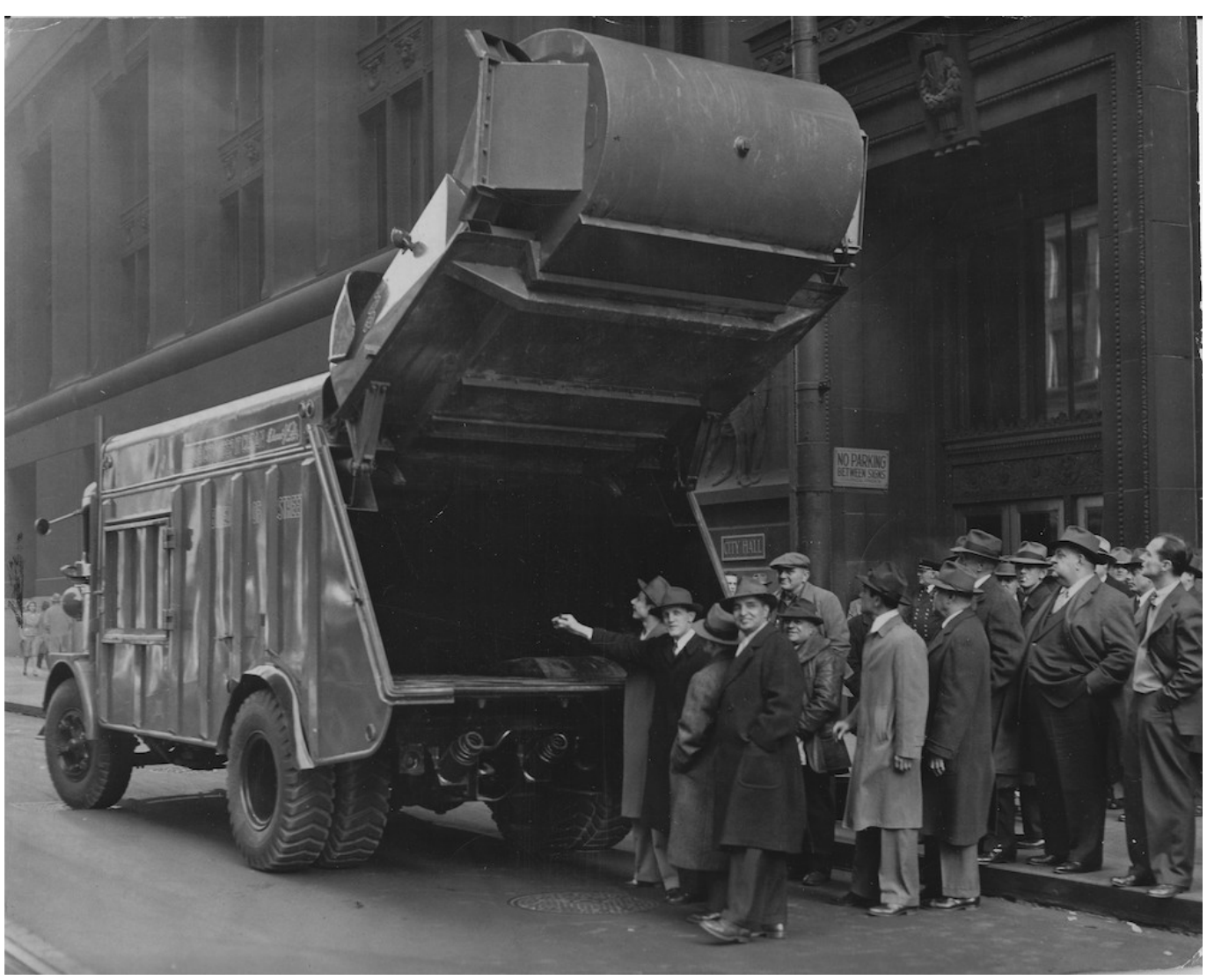
Heil Conveyor wide-hopper version with tailgate extended