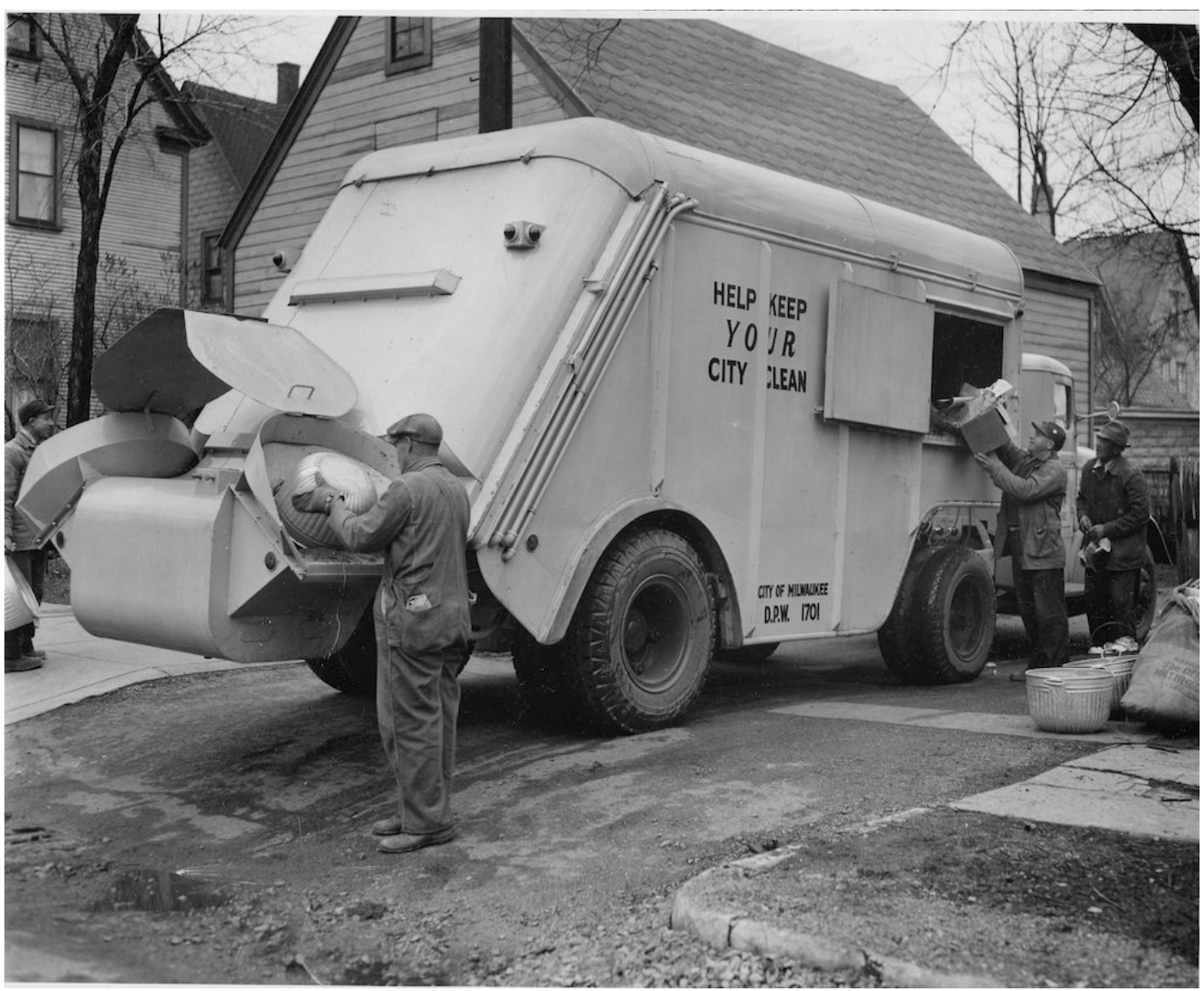
City of Milwaukee 21-yard semi-trailer version being loaded at both ends