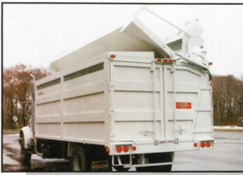
TOP SELECT 1000 "Single side loading"