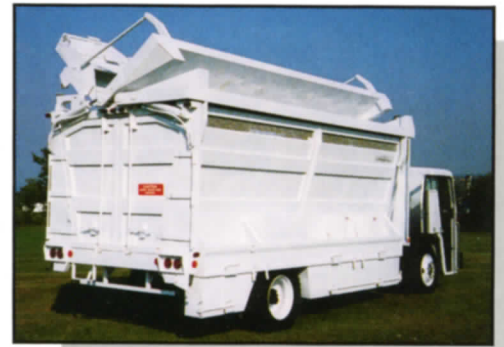
TOP SELECT 2000 "Dual sides loading"