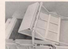
HOPPER COVER (Optional Equipment) Hydraulic Hopper Cover is fully automatic . . . swings closed with minimum overhead height whenever the load is compacted . . . giving extra capacity. Fast hydraulic action opens the cover as the compactor plate retracts.