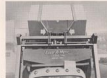
POSITIVE CONTAINER LOCKS Containers are automatically locked to loader triangle with heavy steel pins. The tapered triangle holds containers snug at all times. Vertical coupling and uncoupling . . . with truck standing still . . . works fast and reduces wear on the truck.