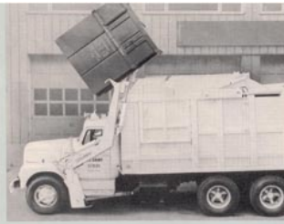
Complete loading cycle is less than one-minute per container . . . from start to finish. Full side loading doors are on both sides of the body for hand loading loose materials not in containers. The Load-A-Matic handles the smallest container to the largest . . . with equal efficiency and speed.