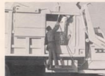
CONTAINER WASHER (Optional Equipment) A great improvement in sanitation service at the container location. It cleans and disinfects with the container over the body. A mechanical pump and pressure regulator recirculate water in the tank . . . and keep the chemicals in solution.