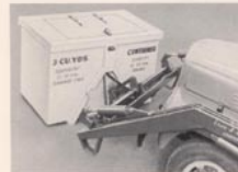
PATENTED BONUS COUPLER LoDal's Triangle Coupler is fast and flexible . . . with extra containers serviced per day. Couples at angles up to 30 degrees . . . reaches out up to 16 inches. Coupling actions are retrieved with no need for precise truck alignment.