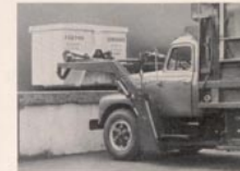
DOCK PICK-UP Containers are serviced from dock height or ground with equal ease. Triangle reach permits containers to be a safe distance from edge of dock. Containers are available with casters . . . and couplers for industrial plants.