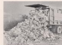
LOAD EJECTION The powerful body compactor plate ejects the load . . . as well as compressing the refuse. A single lever releases the tailgate locks. This high capacity body provides fast clean discharge . . . without danger of over-turning the truck.