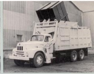
The triangle control cylinders tilt the container . . . and discharge material into the large compactor body. The compactor hydraulically compresses the material into minimum space with 60,000 lbs. of force. Hopper windguards prevent blowage on all sizes of containers.