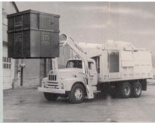
This powerful loader raises the container with fast, smooth action . . . as the operator levels it preventing spillage. The triangle coupler is in full view of the driver. The loader boom arms are rugged box steel members . . . a sturdy machine built for years of service with minimum maintenance.