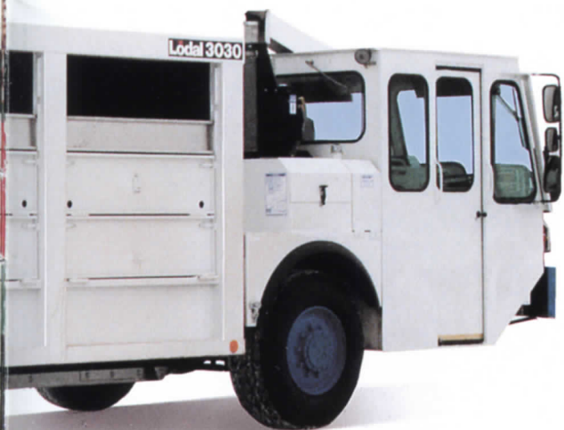
ECO-3030 Recycler with Hydraulic Tailgate