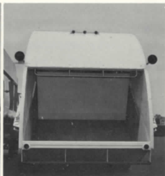
Rugged constructed Packing Panels with direct-thrust. Results in greater compaction.