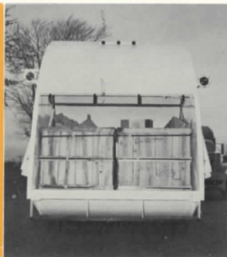
Large capacity Hopper takes two cubic yard load of bulky materials with ease. Start reloading in seconds.

Now comes its big brother, the LOAD-MASTER, to handle bulky material with the same efficiency. The LOAD-MASTER is highly versatile, with a large-size hopper and powerful blade to compact all types of refuse including large, bulky, and odd-shaped objects. Its rugged, dependable construction results in minimum maintenance and maximum efficiency. Speedy reloading, direct thrust compaction, and non-clogging ramrod ejection means that LOAD-MASTER is the most effective batch packer in the industry.