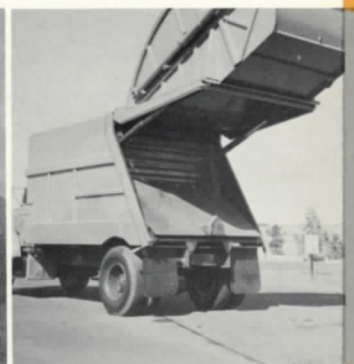
Ease of dumping is assured by Ramrod Ejector Panel.