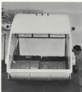
Bulky, odd-shaped objects such as sofas, 55 gallon drums and shipping crates are handled swiftly.