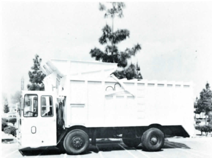
JET FULL-PAK Thirty cubic yard capacity front end loader carries seven ton legal payload on two axles; provides easy, short-wheelbase maneuverability.