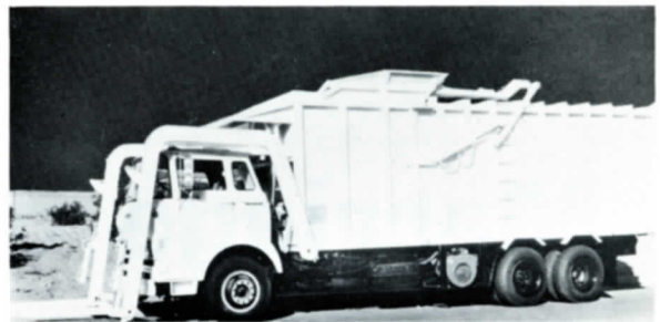
FULL-PAK Up to fifty-eight cubic yard capacity front end loader combines durability, high compaction ratio and low maintenance factor for efficient commercial, industrial and high-density residential operations.