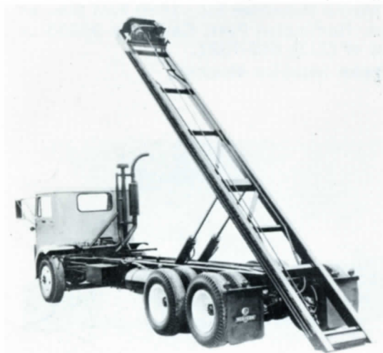
ROLL-OFF TRUCK FRAMES Short or long frame models adapt to any make roll-off container; come in capacities to 15 tons and body lengths to 24 feet.