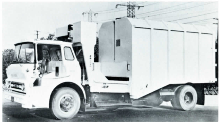
SHU-PAK High compaction side loader provides up to 12 tons of payload with 37 cubic yard body. Optional right-hand drive permits one man operation. Low pitch-in height and continuous loading during packing cycle saves valuable crew time.