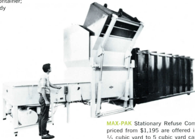
MAX-PAK Stationary Refuse Compactors priced from $1,195 are offered in sizes from 1/2 cubic yard to 5 cubic yard capacities for commercial and industrial use; Transfer stations feature stationary compactors up to 8 cubic yard for single or tandem operation.