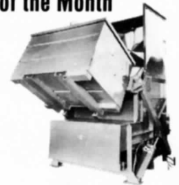
B In Loading Position

Stationary Packer with Front End Loader. Model 203-3 special charge box 72" wide by 4', 10 H.P. hydraulic unit with remote control station. Bin Loader has 2000 lb. capacity.