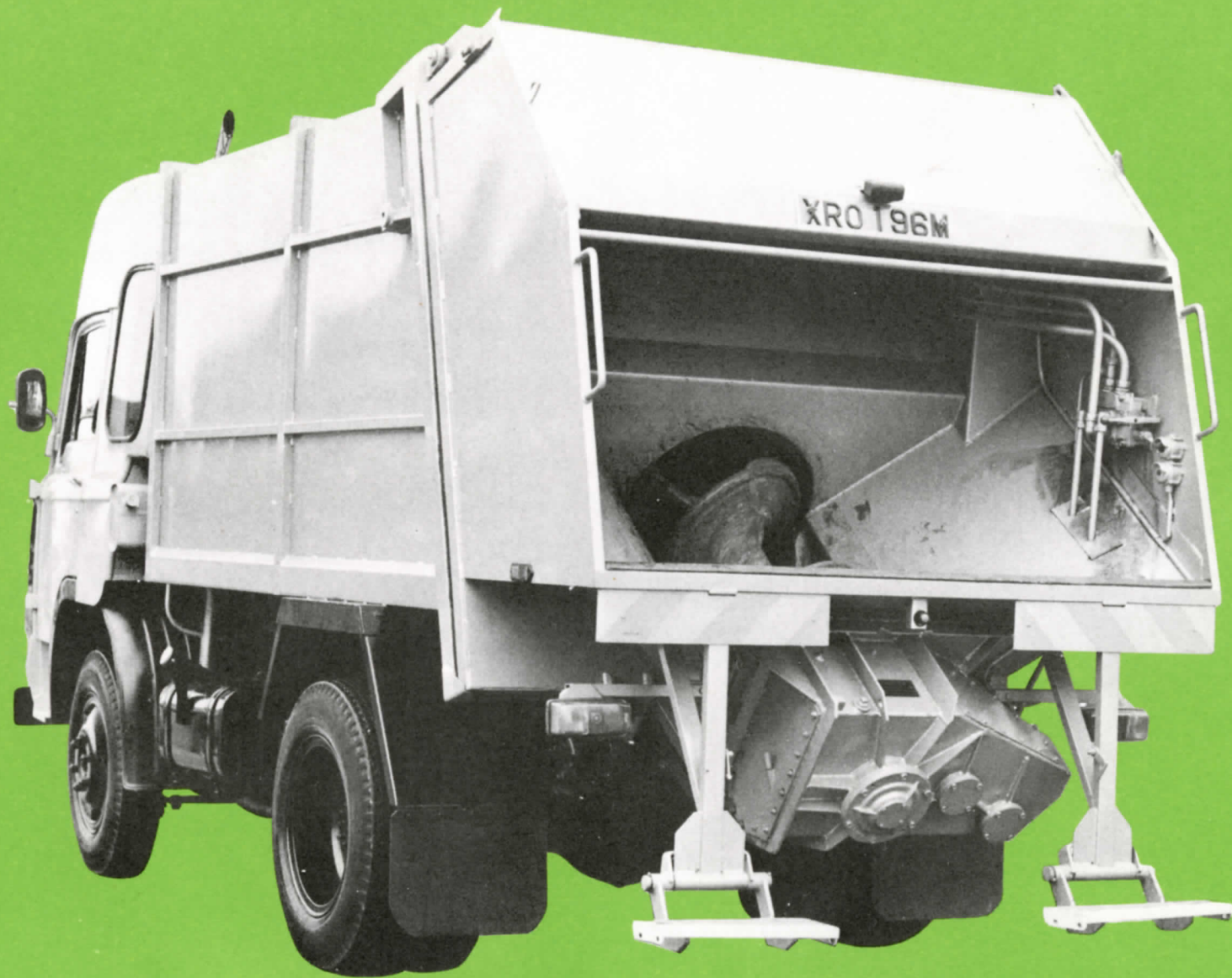
Norba mini screw type refuse collection vehicle