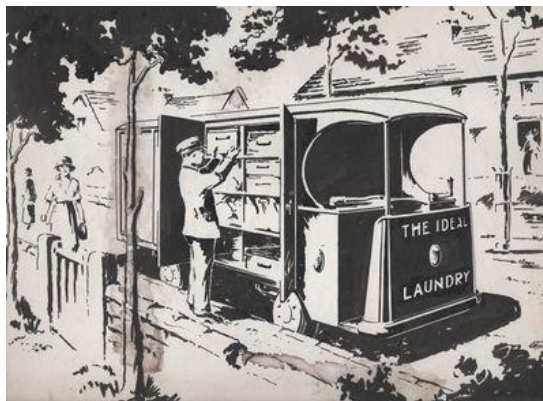
A sketch of the Freighter on laundry service

Indeed compared with conventional practice, the new type offers an enormous reduction of tare – in other words unprofitable – weight, yet without any decrease in what may be called “sustainability.” Though designed fully up to 2-ton loads, the Freighter itself only weighs 21 cwt. : out of 3 tons [*] laden weight 2 tons is useful load, and though it only has a 12 h.p. engine (adequate to the maximum speed of 14 m.p.h.) its transmission is amply strong enough for 30 horse or more.