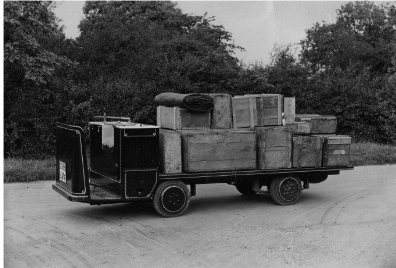
The very original S.D. Freighter, though in appearance possessing much in common with the works truck, is designed for road work at speeds up to 14 m.p.h., and its careful springing and weight distribution afford exceptionally easy riding, even over 'pot holey' roads

The S.D. Freighter can certainly claim to have originated an entirely new type of road vehicle. It takes its initials from its makers, Messrs. Shelvoke and Drewry Ltd., of Letchworth, who Christened it the "Freighter" on the grounds that the new type is to the 3 ton or 5 ton motor wagon what the freighter is to the liner. In its conditions and requirements road traffic varies so widely that development is pointing more and more towards specialised types, and, recognising this, the aim of the Freighter's originators has been the production of a vehicle easily handled in traffic by the most unskilled to the finest speed gradations, and lending itself in general to improved loading facilities.