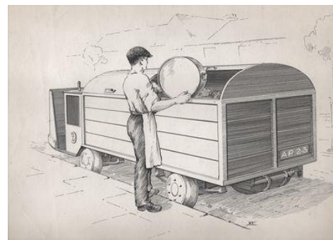
These sketches of the S.D. Freighter in service give an idea of the advantages claimed for specialised traffic.

No great propeller shaft length is necessary, as the wheelbase is only 6ft. 6in. (with a track of 4ft. 1in.) This makes for extreme handiness, but without entailing the usual concomitant disadvantage of extreme overhang. With a standard body 10ft. long, and affording a full 2 ton platform area, only 3ft. 1in. overhangs at the back. Indeed, for such loads as empty beer barrels a 14ft. body has been fitted.