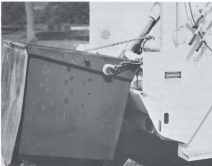
HyPax sweep blade chain attachment handles containers up to 3 cu. yds.