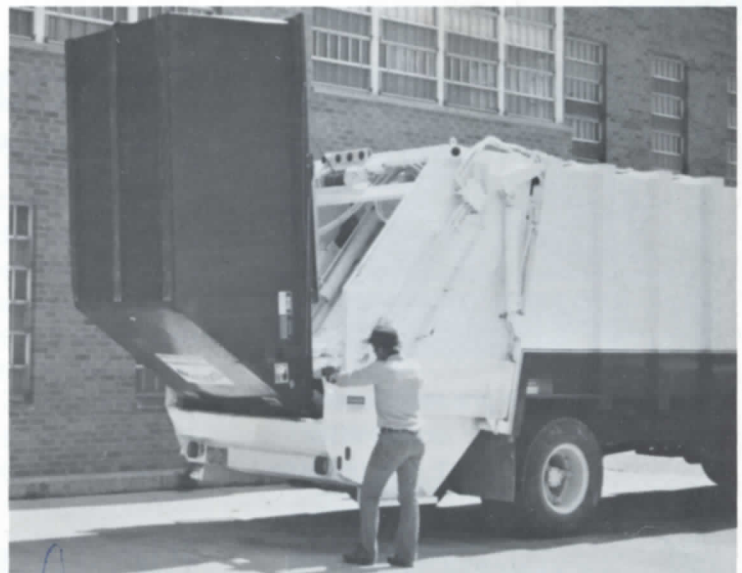
Dump containers up to 10 cu. yds. with overhead hydraulic winch.